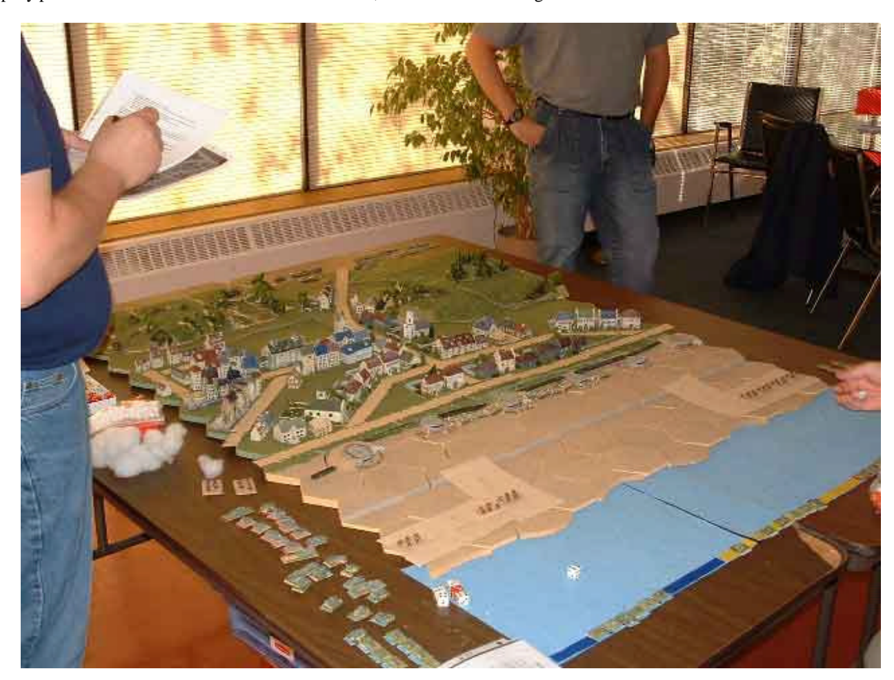
Battle of the Bulge: hey what, I thought this was Juno Beach!

By late morning, Canadian troops had cleared through to the far side of St. Aubin. Only a massive German blockhouse (protected by roadblocks, min efields and trenches) in the middle of the village remained. Underground tunnels, however, allowed German troops to reappear in previously cleared areas. The blockhouse was cleared in early evening. In the meantime, North Shore's C - Company penetrated 4km i nland to the town of Tailleville, another German stronghold.