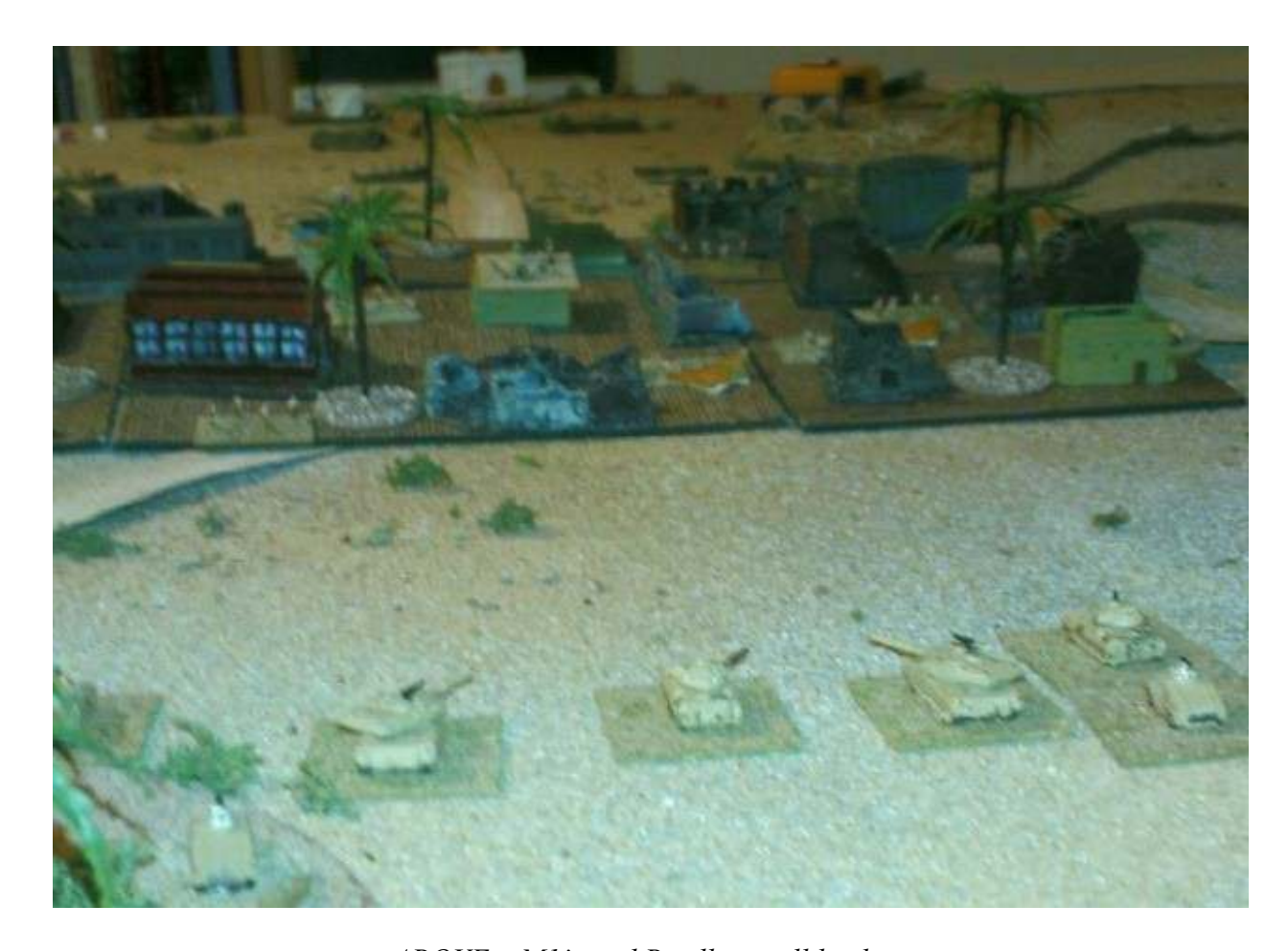
ABOVE – M1's and Bradleys pull back