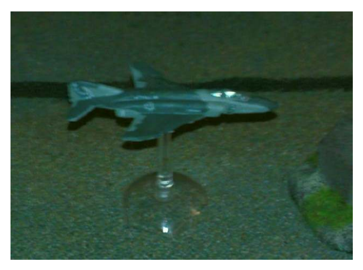
ABOVE Picture of F4 making its brief appearance in the game