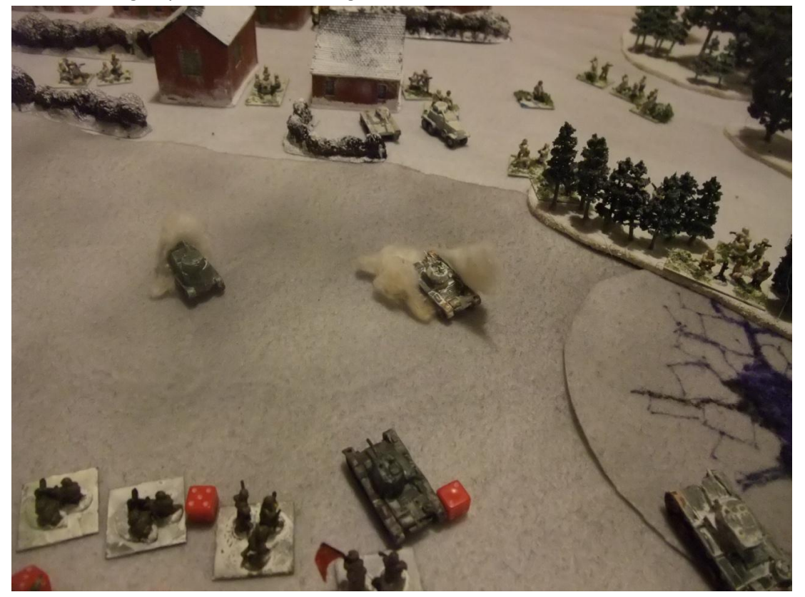
The Leading T26s are taken out by the Finnish ATG between the houses and the Finnish BA10 & T26.