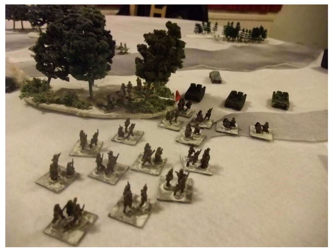
Russian Battlegroup 3 start their flanking move – oblivious of the Finns in the trees.