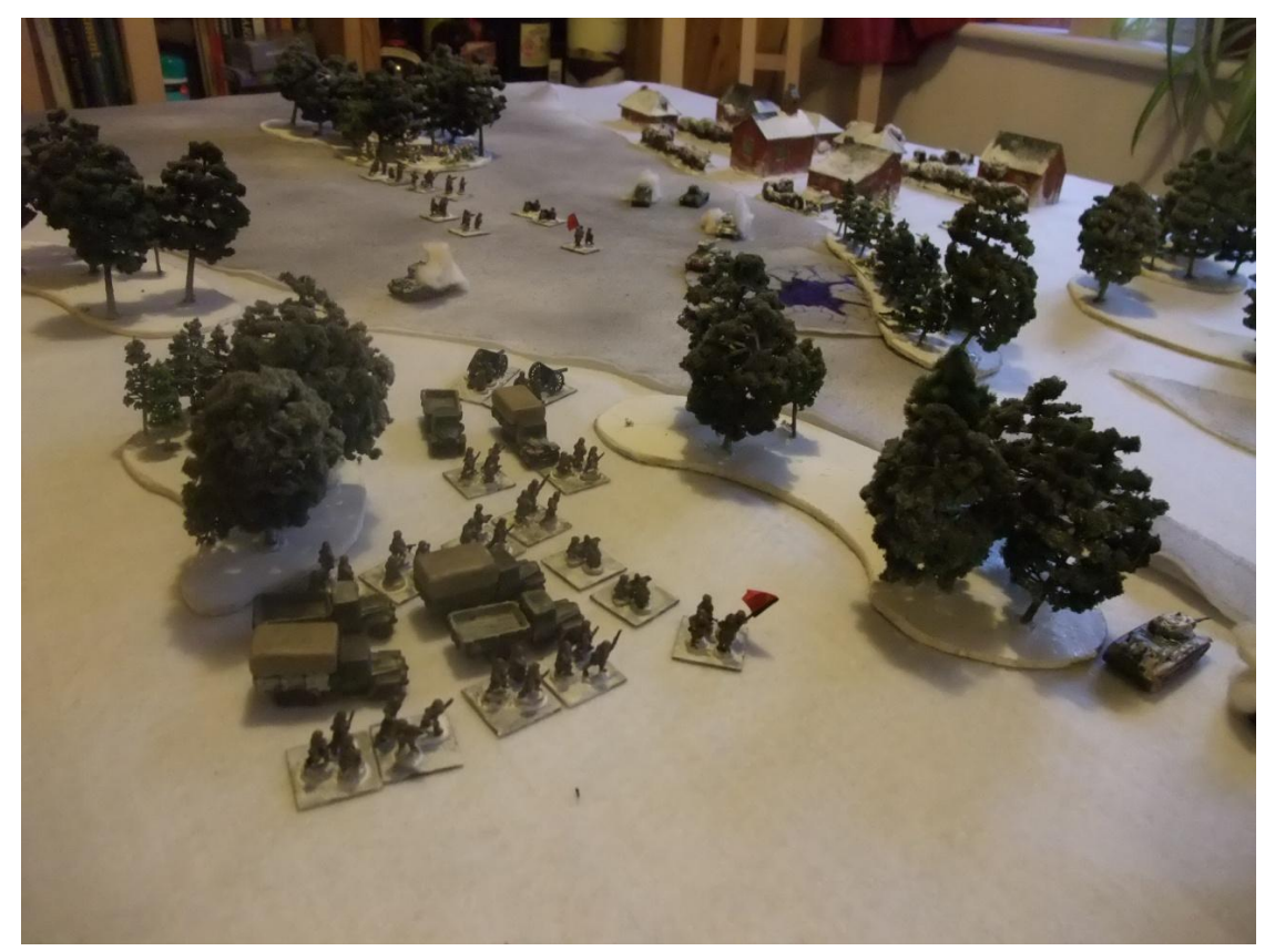
Potentially the Russians can still take the village