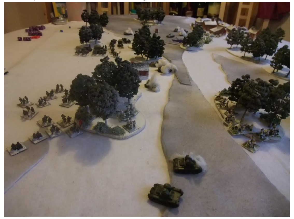
But Russian Battlegroup 3 is also having problems