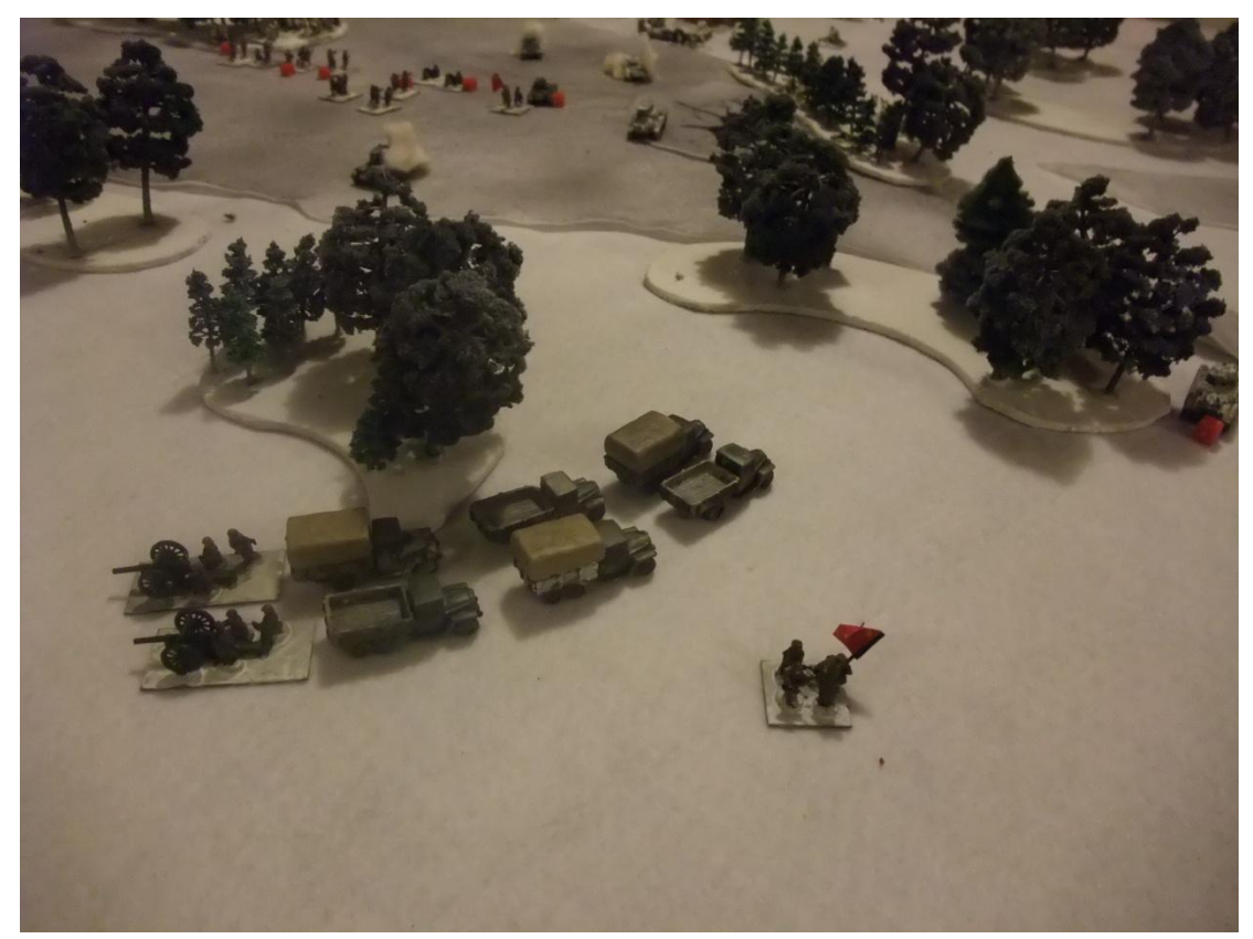
Russian Battlegroup 2 couldn't deploy due to poor dice and the crap CV of the HQ