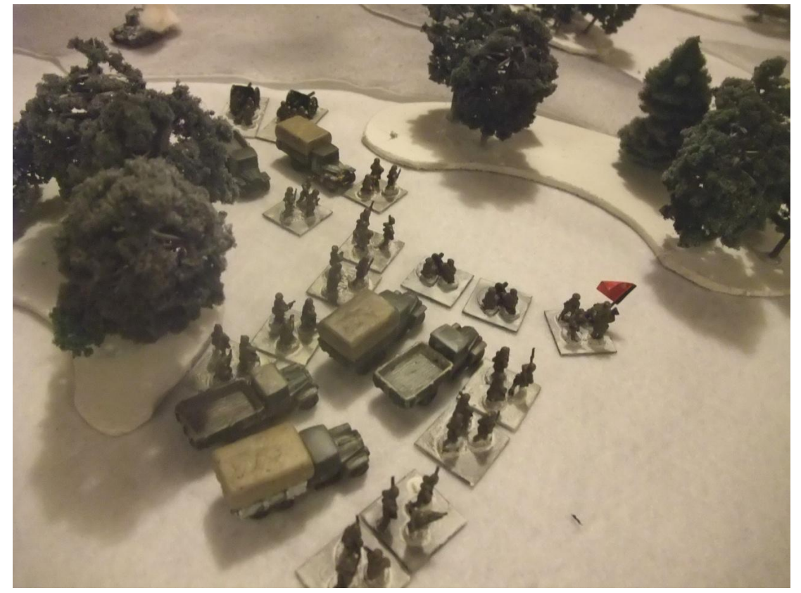
Finally they deploy – but they are destined not to move again!