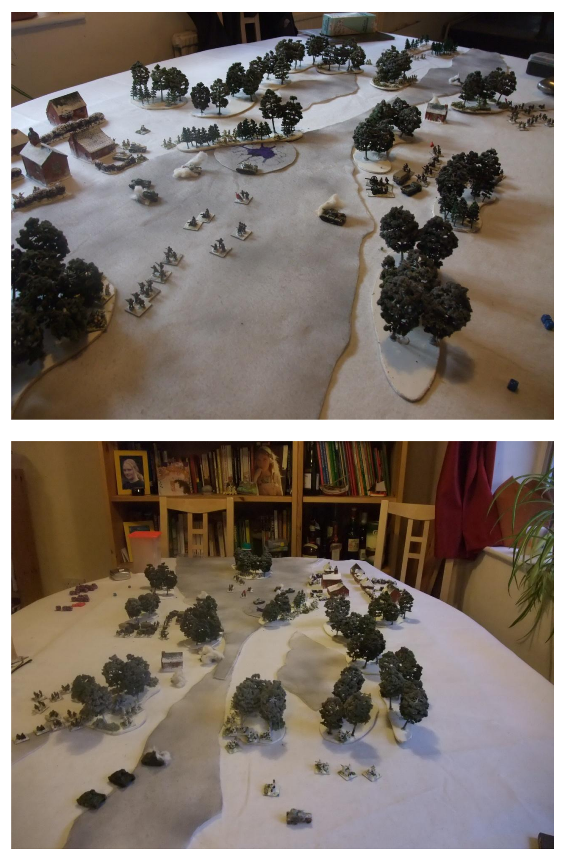
Overall views – The Russians wouldn't get much farther.