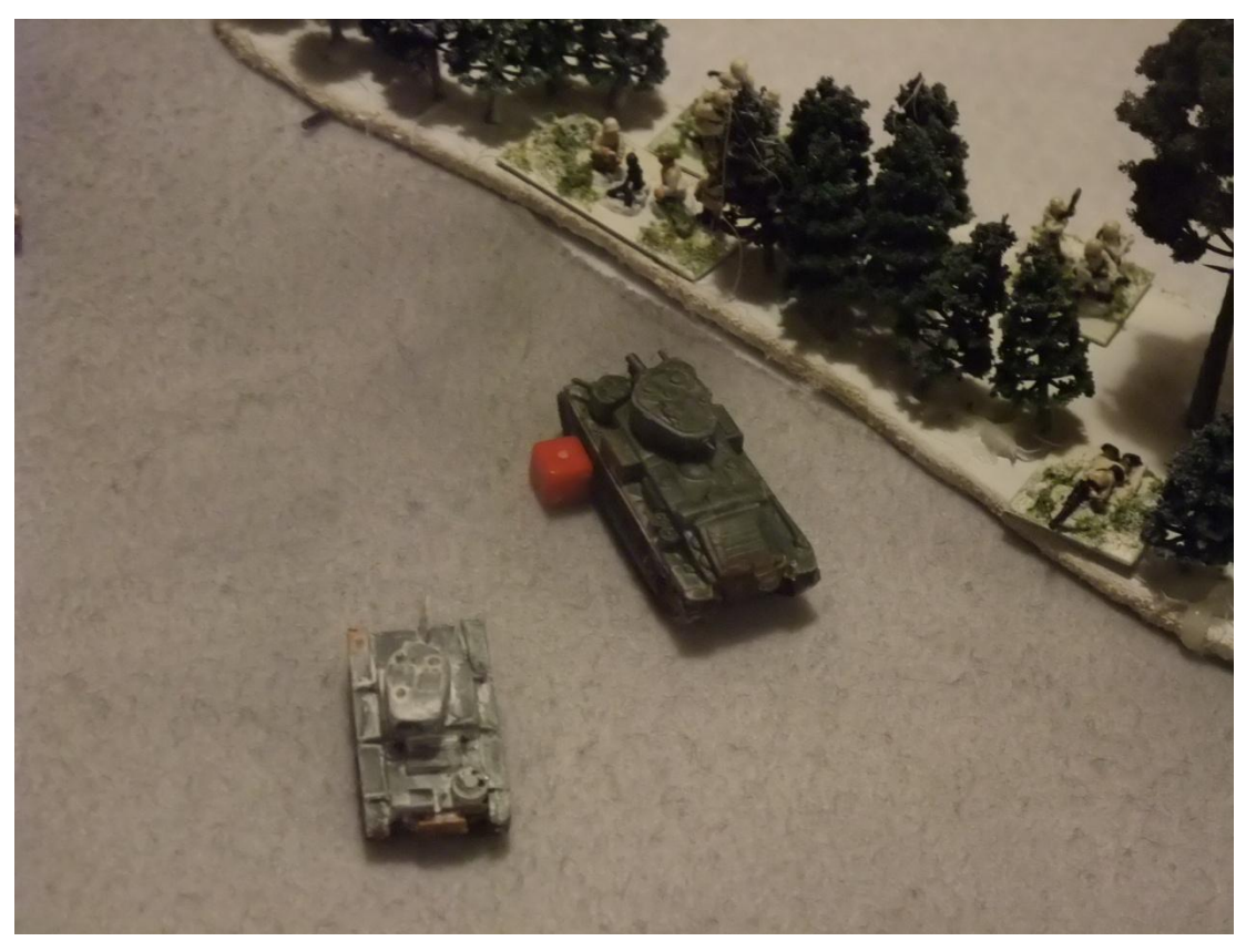
The T28 starts to menace the Finnish Infantry when a loud cracking of the ice is heard