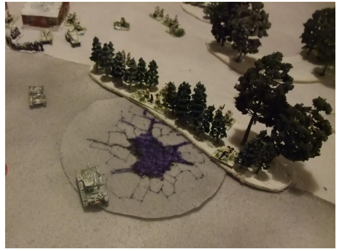
Suddenly it is gone – the T26 narrowly misses the same fate.