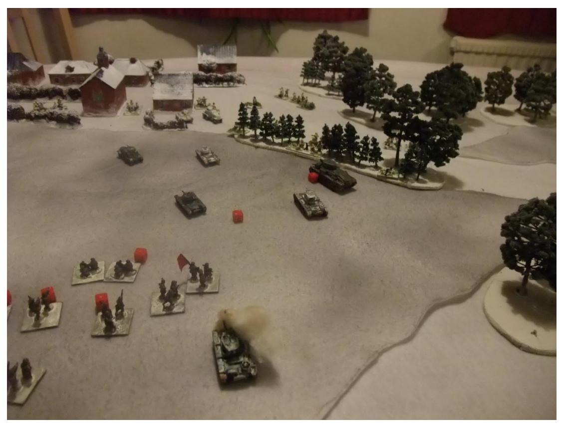
Battlegroup 1 continue their advance across the ice – but things are about to go wrong.

Battlegroup 2 – The column of trucks await in the background whilst the tanks and armour car locate the minefield the hard way!