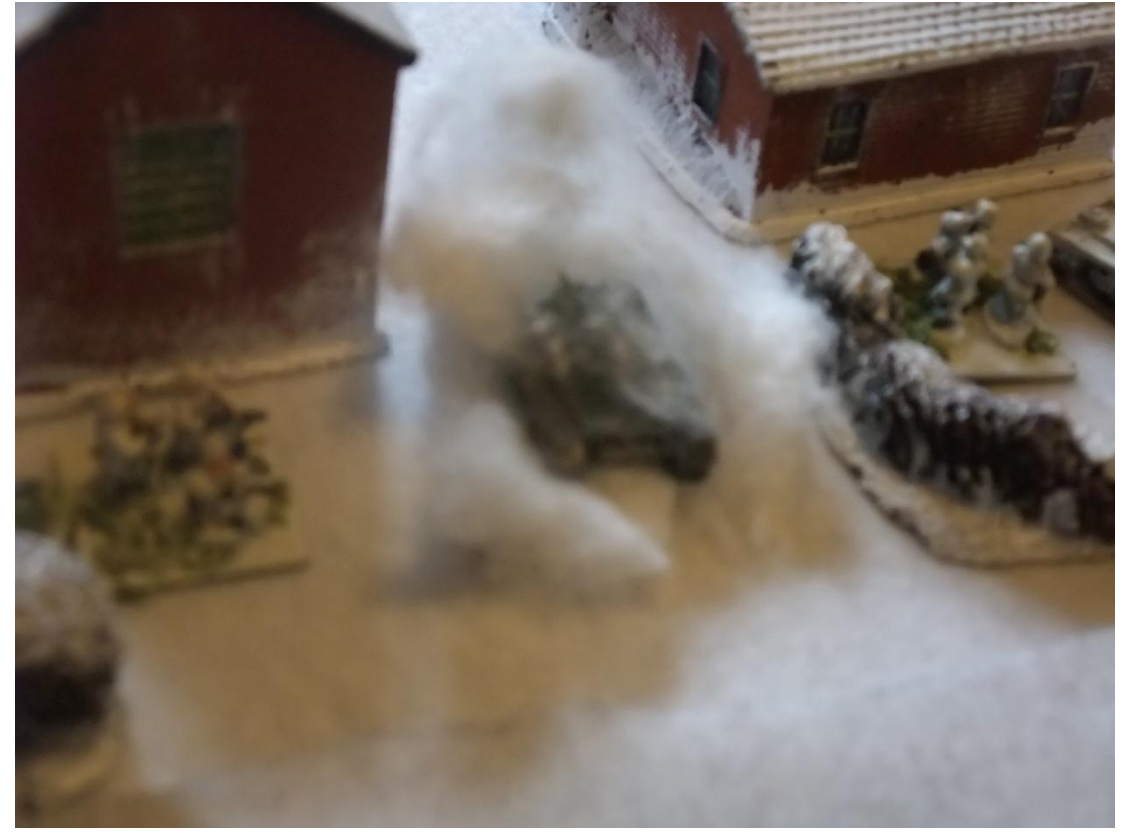
Exploding Tanks always cause Camera Shake!