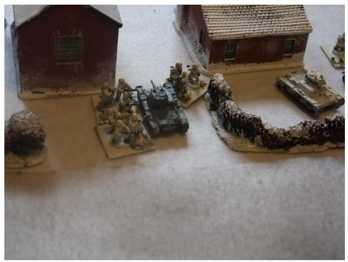
Having disposed of the Finnish ATG the Russians foolishly advanced only to be close assaulted.